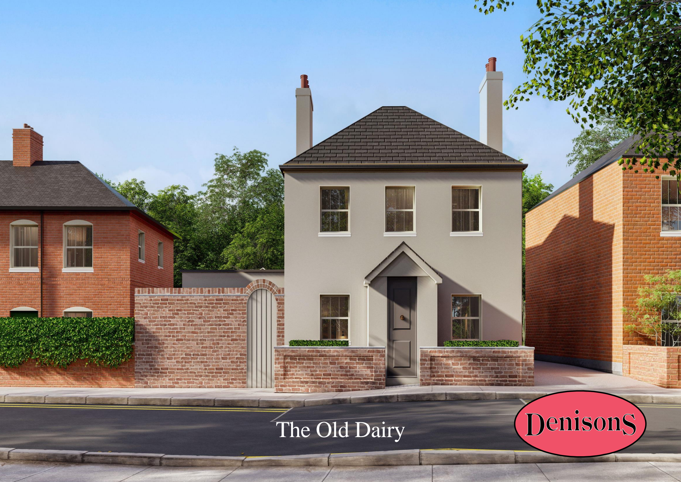
The Old Dairy